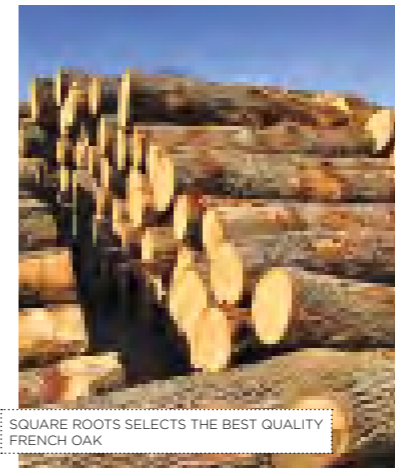
SQUARE ROOTS SELECTS THE BEST QUALITY FRENCH OAK