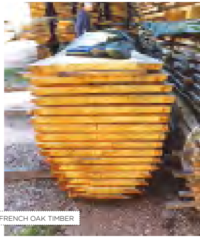
FRENCH OAK TIMBER