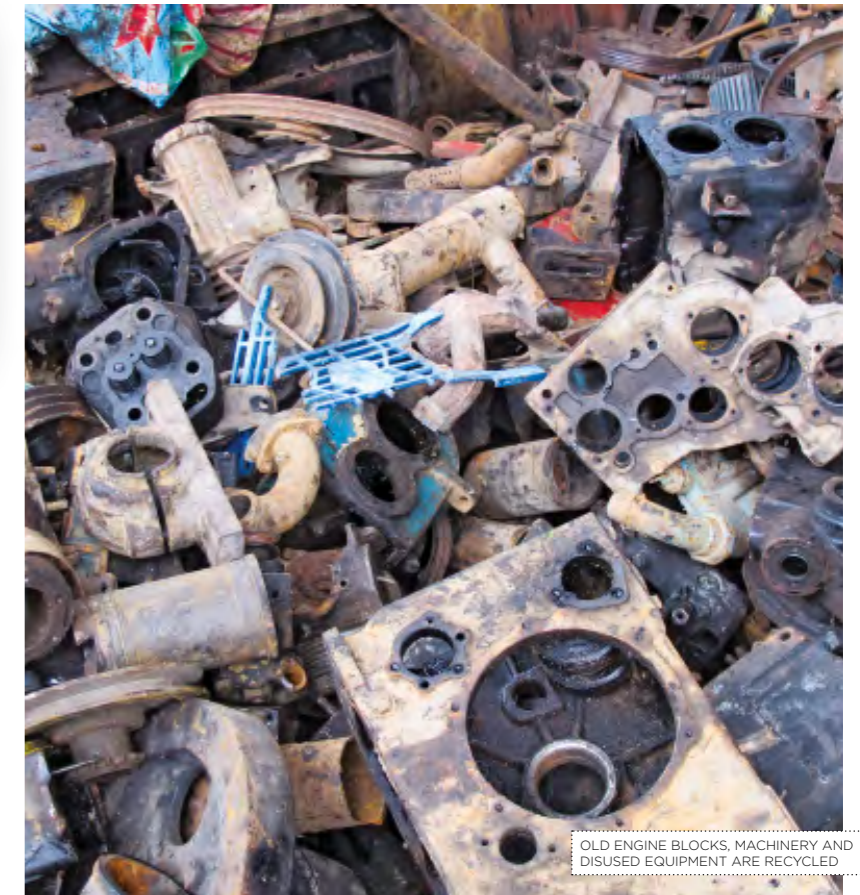
OLD ENGINE BLOCKS, MACHINERY AND DISUSED EQUIPMENT ARE RECYCLED

The process is highly skilled and can produce a great variety of shapes and effects that serve to show the true beauty of the wood.