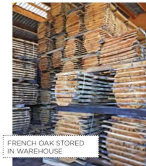
FRENCH OAK STORED IN WAREHOUSE