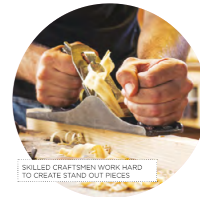
SKILLED CRAFTSMEN WORK HARD TO CREATE STAND OUT PIECES

The result of Square Roots' hard work and sustainable ethos is