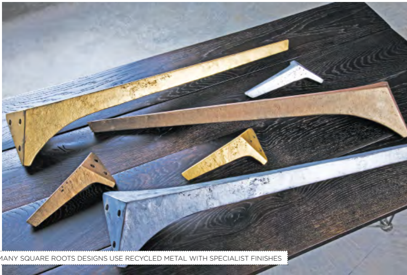
MANY SQUARE ROOTS DESIGNS USE RECYCLED METAL WITH SPECIALIST FINISHES