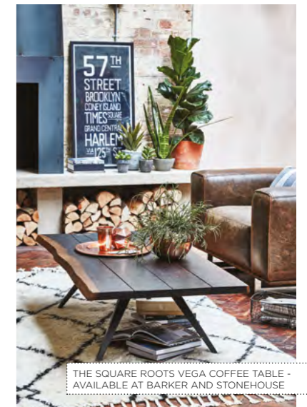
THE SQUARE ROOTS VEGA COFFEE TABLE - AVAILABLE AT BARKER AND STONEHOUSE

The company now employs over 250 people and distributes to retailers across Asia, the Americas, Australasia, South Africa, France and the UK, via Barker and Stonehouse.