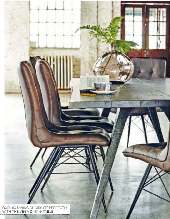
OUR HIX DINING CHAIRS SIT PERFECTLY WITH THE VEGA DINING TABLE