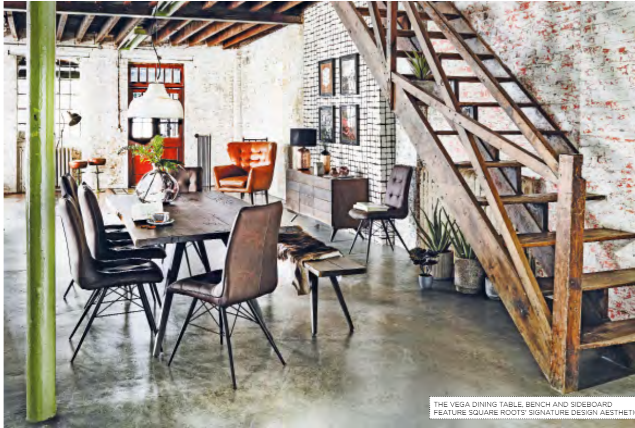
THE VEGA DINING TABLE, BENCH AND SIDEBOARD FEATURE SQUARE ROOTS' SIGNATURE DESIGN AESTHETIC.

Square Roots combine the secrets of the alchemist finisher and the wisdom of the woodsman to craft unique furniture that's rooted in green principles.