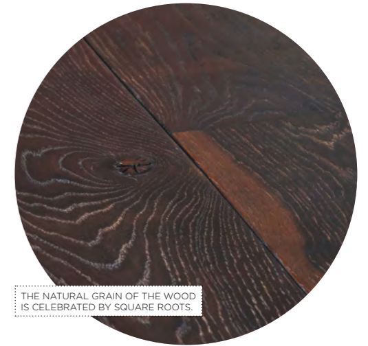
THE NATURAL GRAIN OF THE WOOD IS CELEBRATED BY SQUARE ROOTS.

"Grown in the upland region of Burgundy, the Oak is perfect for our needs due to the cool climatic conditions and forests that produce harder, heavier timbers"